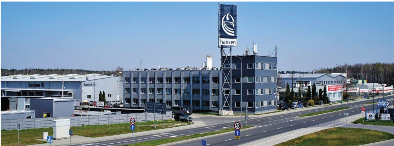
Fig. 1. Hansen Polska manufacturing plant located in Głogów Małopolski, Poland.

Hansen Polska is the manufacturing plant within the group. The company is located in Głogów Małopolski, Poland (Fig. 1). The production facilities including warehouse covers an area of 7 800 m 2 .